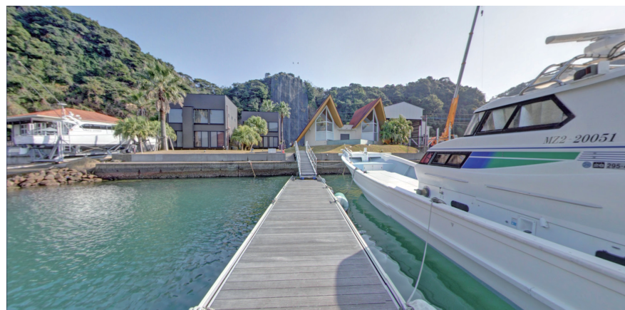
“Calm LANAI Harbor” floating pier (view from west)